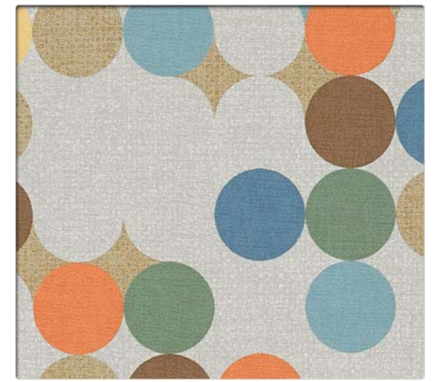
PNG10 Mai Tai